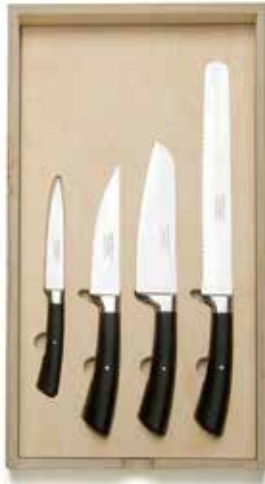
E 'Black Handle' Specialist Set