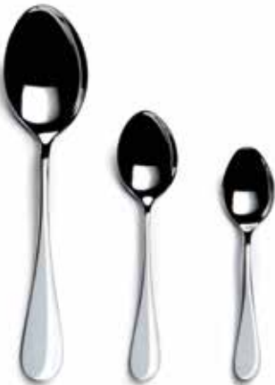
Serving Spoon Fruit Spoon Tea Spoon