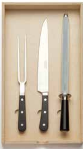
G 'Provençal' Carving Set