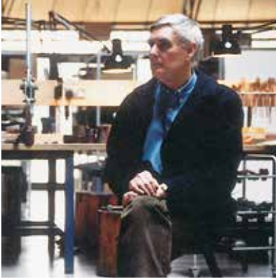
David Mellor in the Round Building

David Mellor (1930-2009) was one of the great 20th century designers with an international reputation for his cutlery. He was born in Sheffield and trained originally as a silversmith. Examples of his metalwork are in museum collections all over the world.