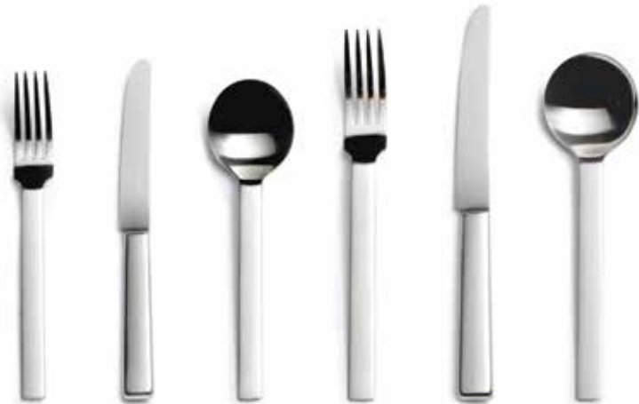
Dessert Fork Dessert Knife Dessert Spoon Table Fork Table Knife Soup Spoon

Available as: Individual Pieces Six-piece Place Setting 44 and 58-piece Canteen, see p39