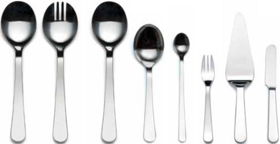
Salad Servers Large Serving Spoon Serving Spoon Long Spoon Cake Fork Cake Server Butter Knife