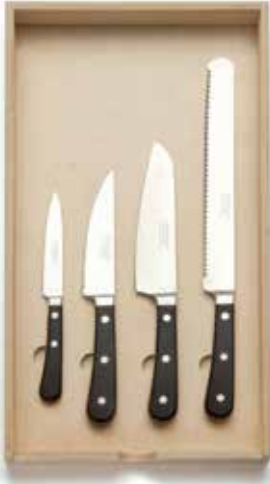
D 'Provençal' Specialist Set