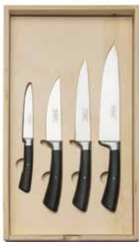
B 'Black Handle' Starter