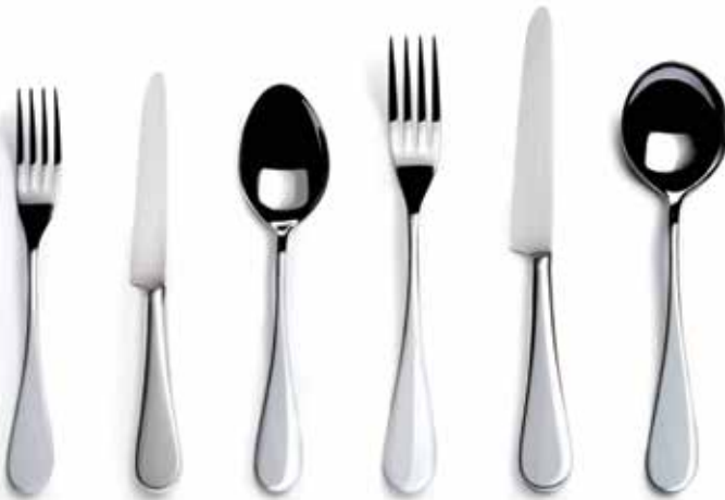
Dessert Fork Dessert Knife Dessert Spoon Table Fork Table Knife Soup Spoon

Available as: Individual Pieces Six-piece Place Setting 44, 58 and 88-piece Canteen, see p39