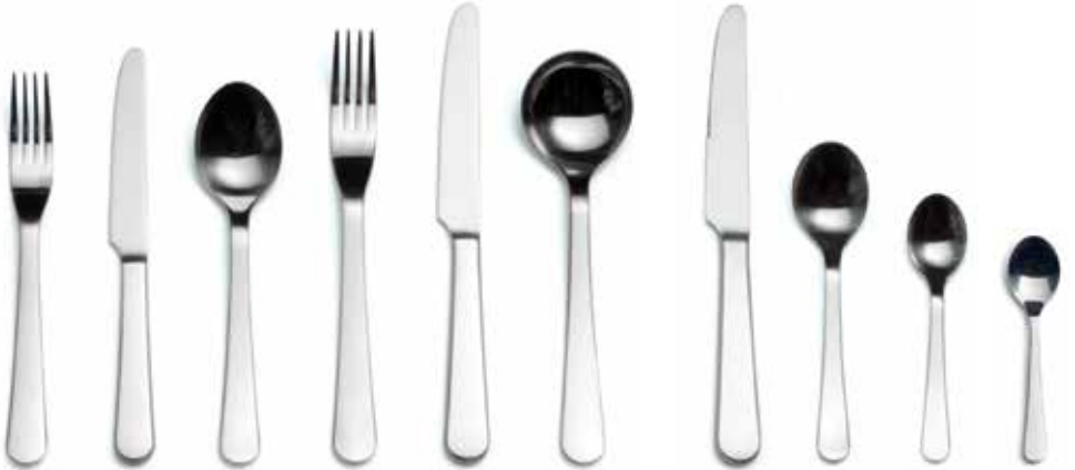
Dessert Fork Dessert Knife Dessert Spoon Table Fork Table Knife Soup Spoon Steak Knife Fruit Spoon Tea Spoon Coffee Spoon

Available as: Individual Pieces Six-piece Place Setting 44, 58 and 88-piece Canteen, see p39