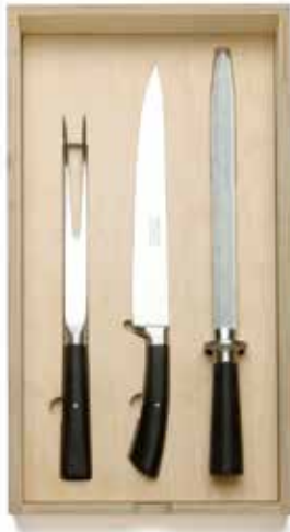
H 'Black Handle' Carving Set