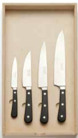
A 'Provençal' Starter Set