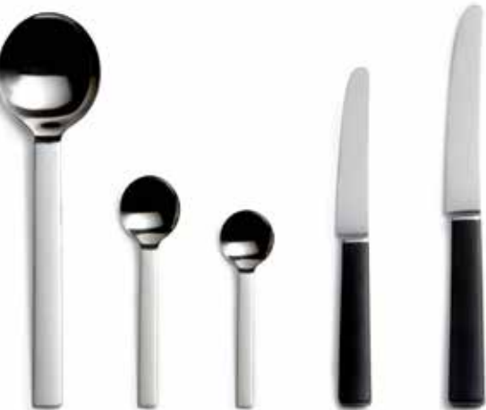
Serving Spoon Tea Spoon Coffee Spoon Dessert Knife Table Knife